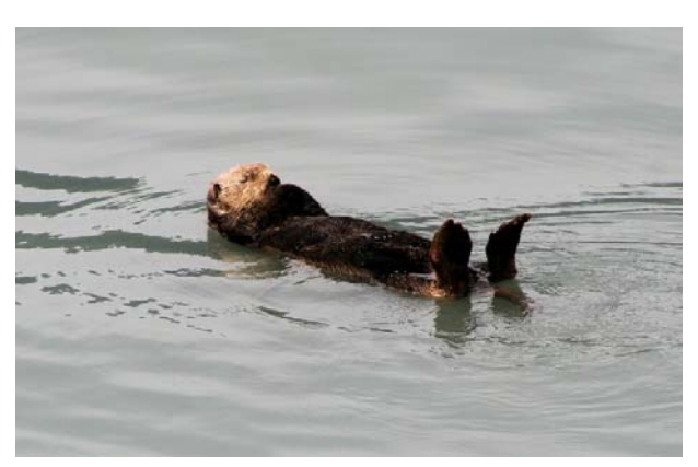
Sleepy Sea Otter