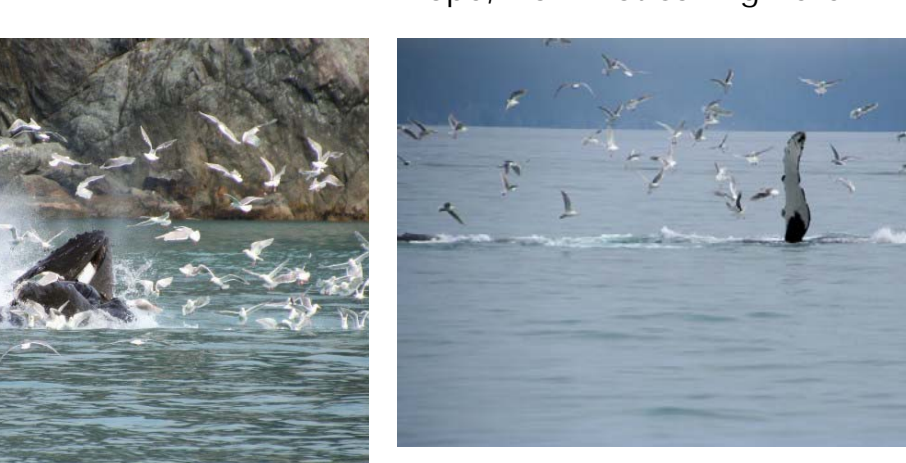
Here are three whales working together.

They find a ball of bait fish dive down deep and from three different angles they shoot up to the surface with their mouths wide open breaking the surface and scooping up hundreds of little fish in the process.