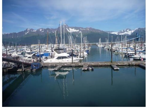
Cheers, B & W

Our boat docked at 5.30 PM, bus left at 6.30 PM, 2 1/2 hours back to Anchorage and a final cab ride put us back at the hotel shortly after 10 PM. Today (it is now 11AM) is our final day in Alaska and we have one special tour left this afternoon before