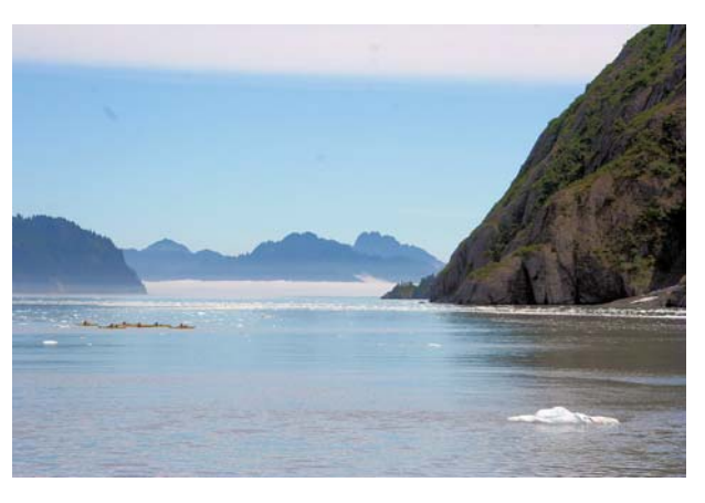
Note the fog bank on the water