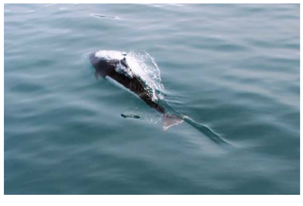
Dalls Porpoise (looks like a tiny Orca). They are FAST!! Over 30mph!