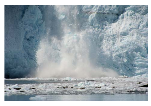
Glaciers calving (ice breaking off).