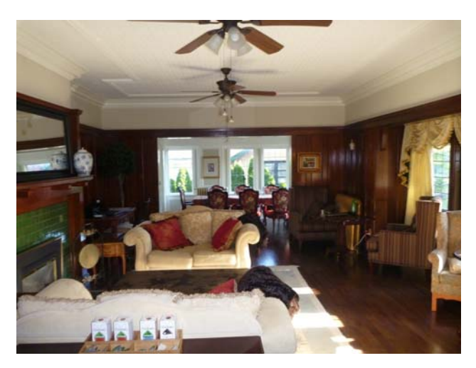
The common area in our B&B. We hung out here and got a couple from Tacoma, WA drunk off their asses!

Last night we had an enjoyable evening staying at the B&B and socializing with other guests. We were too tired from all the walking to go out and ordered in instead. Not to mention the winds picked up and it got COLD!! 20knot + winds shearing over 45F water makes for a convenient recipe of ice cubes in our veins! We hadn't felt that kind of chilled to the bone since we lived in Maine. They have a great service called Beer and More to go, and they will pick up and deliver whatever you want from any place. So we ordered a meal, a bottle of wine and a bottle of whisky. No problem, arrived 30 minutes later. Can't beat that!