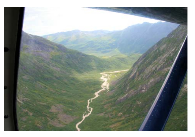
We followed the stream down the valley