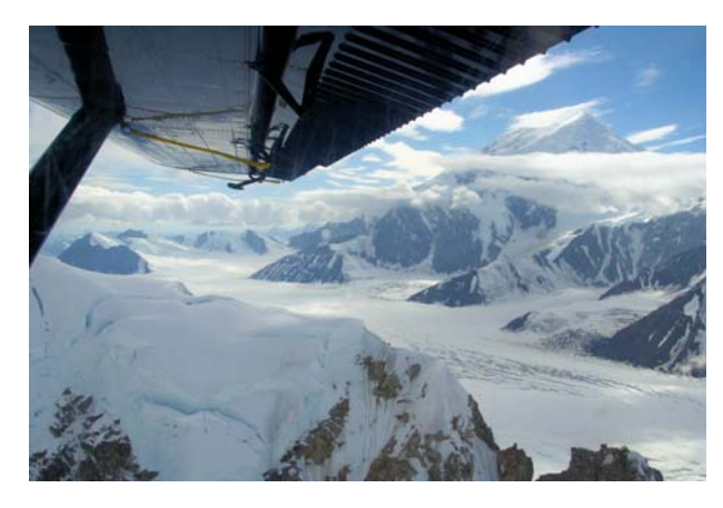
Snow field on top of glacier