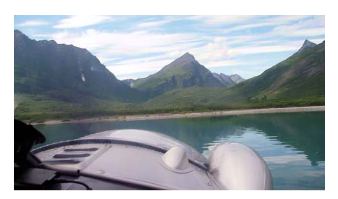
And the plane landed on the lake