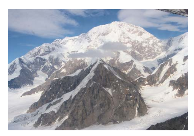
Mount McKinley - we are flying at 10,000 feet and still have to look up to it!