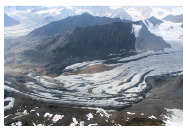
Glacier ends and the water runs down the mountain in a stream