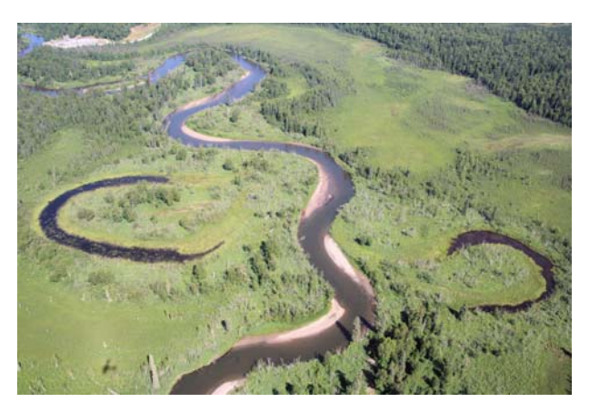
The first hour was flying over desolate tundra, no road in sight