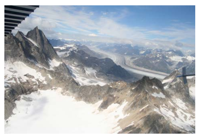
The ice on the glaciers is 600 feet thick