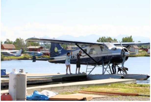
The plane was a 1959 Canadian built Beaver with pilot and 5 passengers.

We saved the best for last! As we only had one day left and that is not enough time to visit the tallest mountain in North America, Mount McKinley (20,000 feet) by road, we decided to rent a seaplane and fly there! It is located in the Denali National Park 265 miles north of Anchorage.