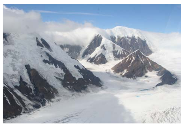
Note how the clouds just lay on the mountains like a table cloth