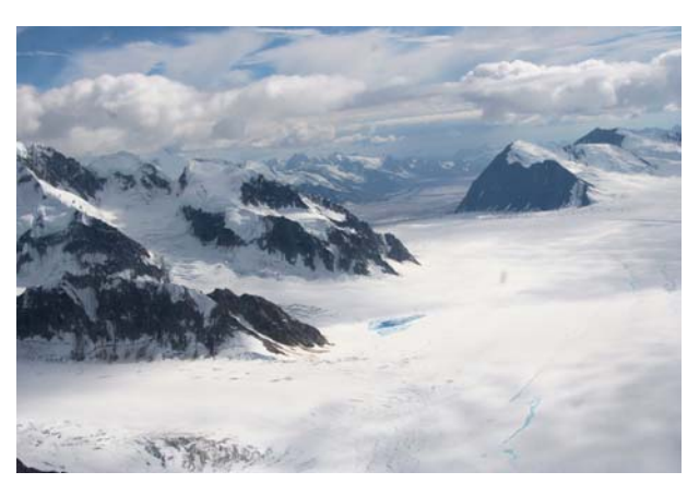
Note the cobalt blue water lake