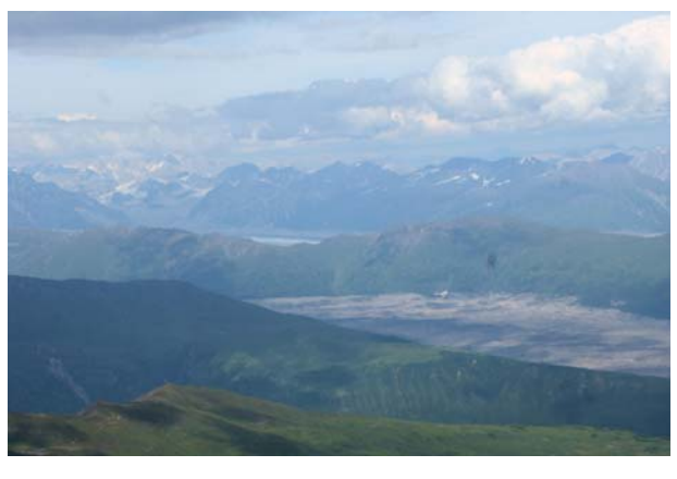
Then in the distance the mountains wove into our sight.