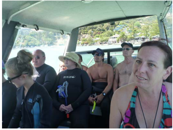
dorsal fins and silver white bodies.

The water here is somewhere between damn cold and freakin' freezing, so they provided us with 5mm wetsuits and off we went in their 14 seater boat to hunt down these little critters.