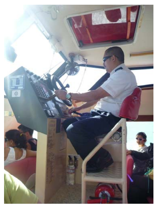
A captain driving the shuttle boat back to the cruise ship.

So therefore, every single land mammal on either island was introduced by Europeans. Prior to this there were just birds and fish.