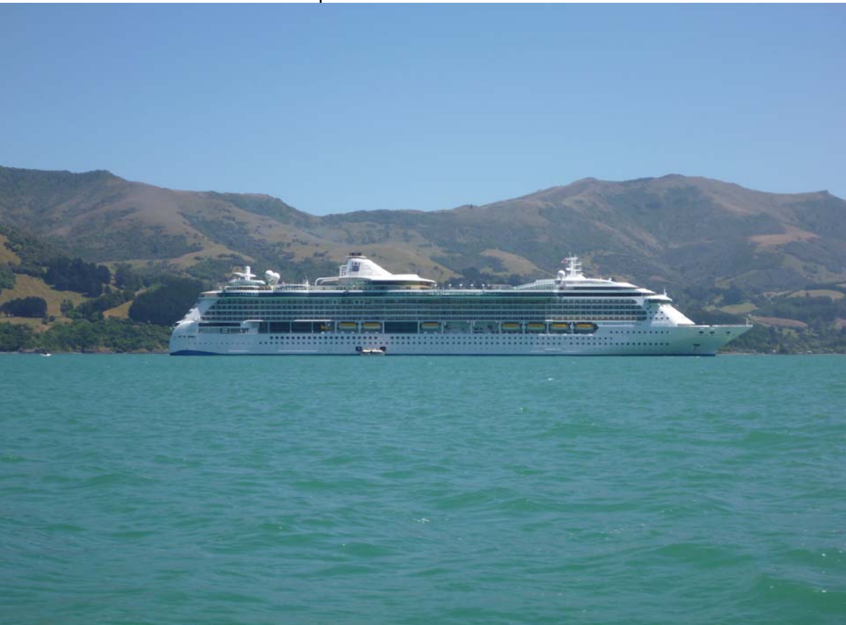
Our ship at anchor

Because there were no natural predators on land, many birds became flightless (like the emu) choosing to walk instead of fly and it was only when the Maoris arrived and started to eat them that 35 species of flightless birds became extinct.