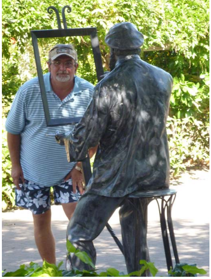
Me camping it up at a sculpture of an artist.

Several million years ago NZ, Australia and Antarctica where one land mass. When they separated there were NO land mammals on either North or South island in New Zealand.