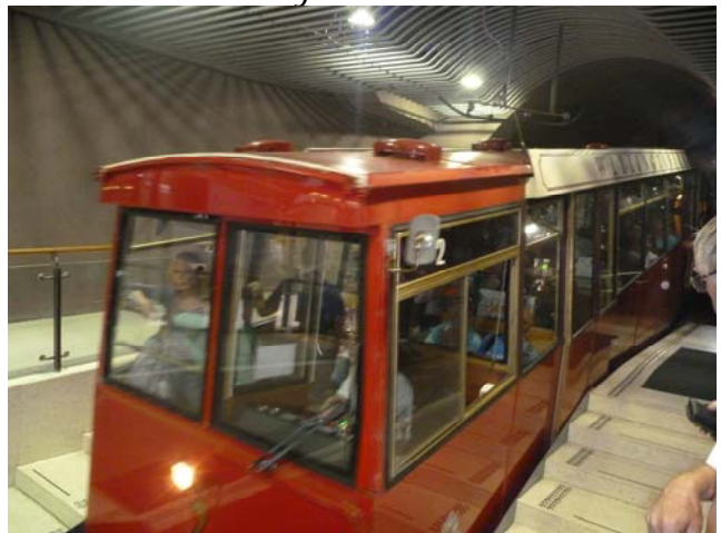
The "cable car" above and downtown Wellington on the left.