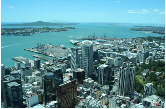
Auckland is nestled in a natural harbor, once again created by an earthquake. The island you see in the distance only rose out of the sea as recently as 600 years ago!

Our next stop was to go up the Sky Tower, the tallest structure in New Zealand – and in all of the Southern Hemisphere. It's taller than the Eifel tower and almost as tall as the Empire state building. The views from the top were quiet stunning.