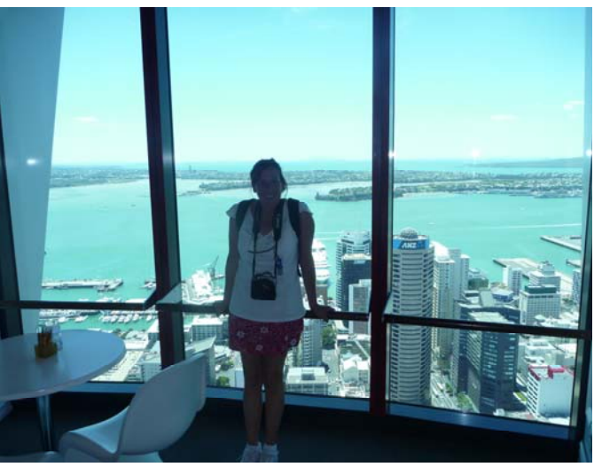
A room with a view