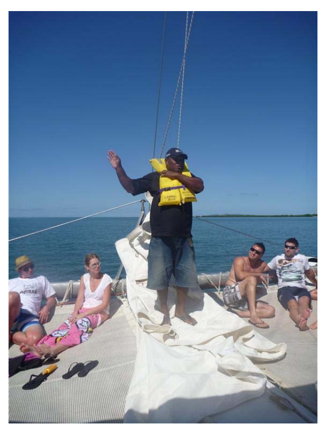
Captain giving the safety speech

for show. We had the same experience when we went to Jamaica.