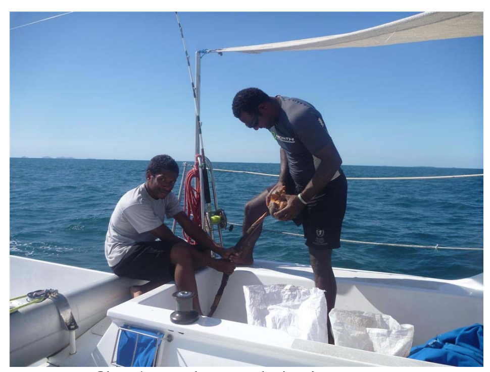
Showing us how to de-husk coconuts

In the USA I am used to being the center of attention because of my "Quaint" English accent and people are always coming up to me and asking me where I am from.