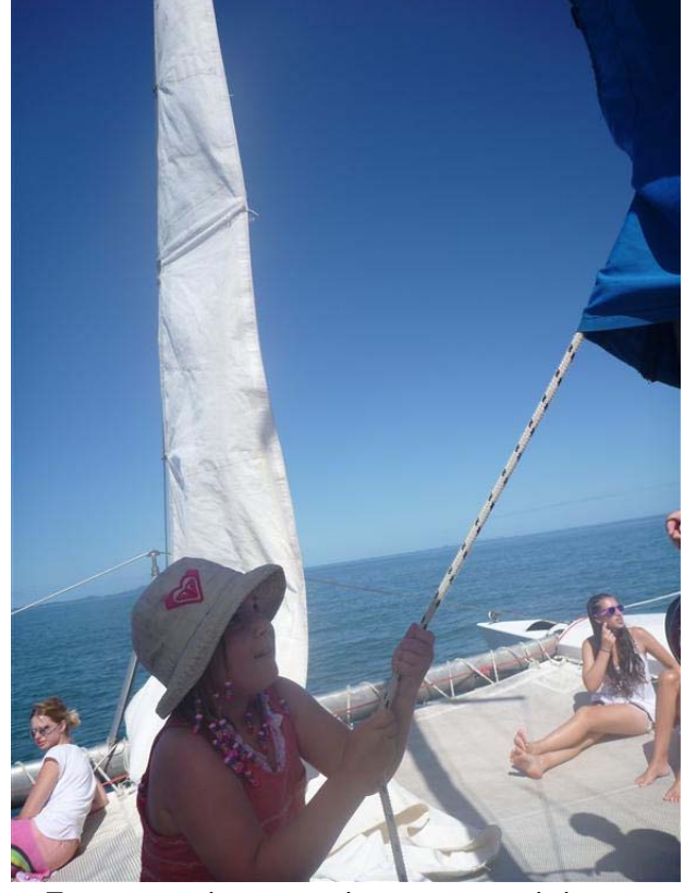
Encouraging tourists to participate