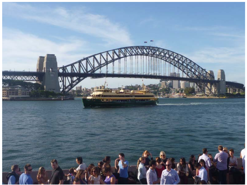
Sydney Harbor Bridge directly opposite the Opera House where we were having a beer with 10,000 other people.