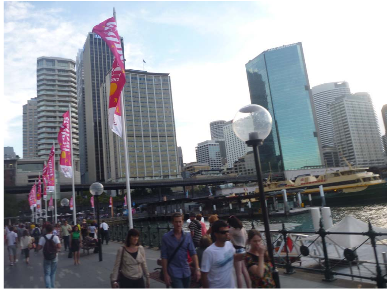
Walking back to our hotel

I am coming down with a cold and the cheapest cold medicine was $11.00. Sodas and juice appeared to be the same price as the USA.