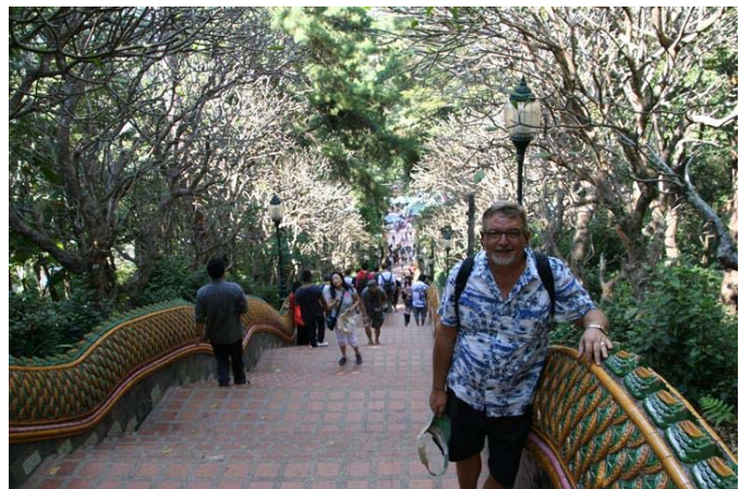
Going back down we decided to take the stairs instead of the vernacular – all 300 of them!