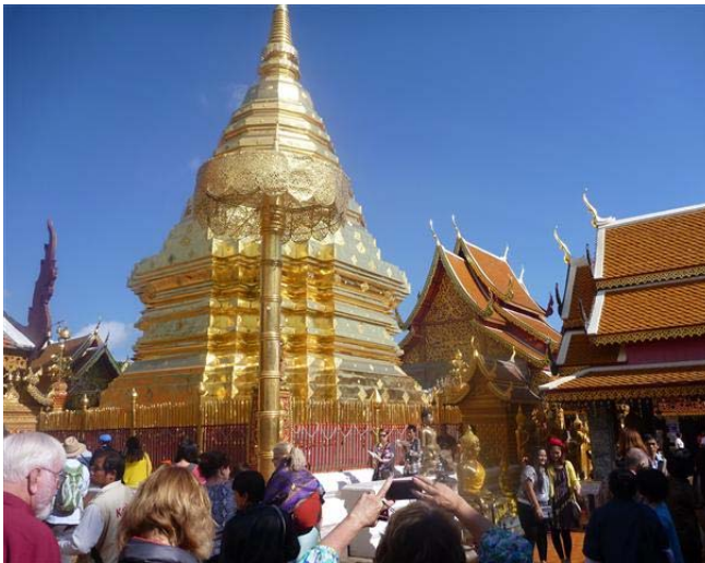
Now here's the temple at the top of the mountain, took 40 minutes in the bus and a vernacular ride to get here. Also gold plated.