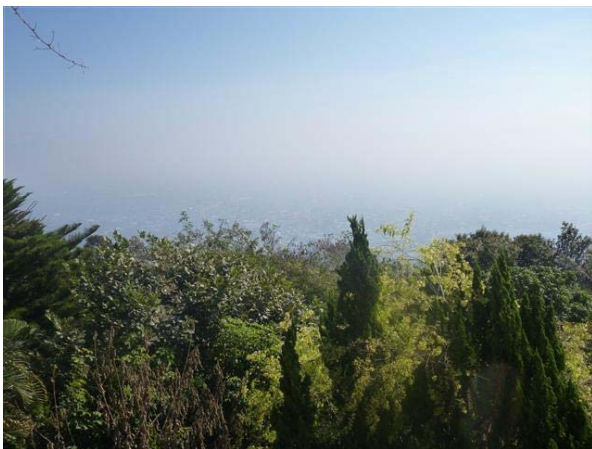
There is a great view of the city from the mountain – or so we were told – we saw smog!!