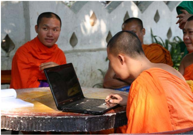
Even monks have FaceBook pages they need to check...