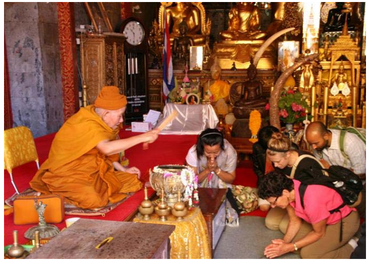
Here is the senior monk splashing our tour group with holy water.